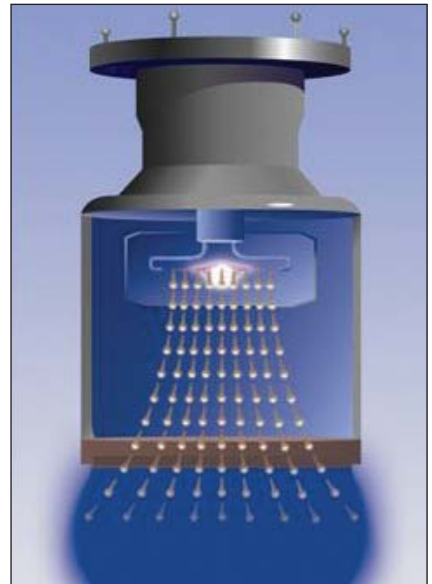
Figure 1: Illustration of Advanced Electron Beams Emitter

Electron beams work by directing a shower of accelerated electrons through a high voltage emitter toward a target (Figure 1). The electrons are generated from a tungsten filament and directed by a high voltage source inside of a vac-