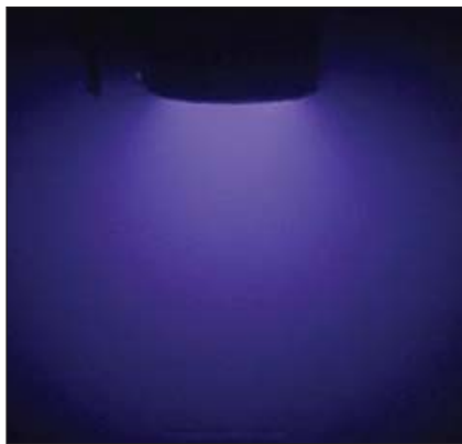
Figure 2: Electron and Air Molecule Collision and Scatter

As the energetic electrons enter the atmosphere, they collide with air molecules and scatter (Figure 2), creating an atmospheric plasma that acts as an electronic “brush”—delivering sterilizing energy directly to surfaces as well as around product contours, such as a bottle cap threads. Additionally, electron beams will penetrate through thin packaging